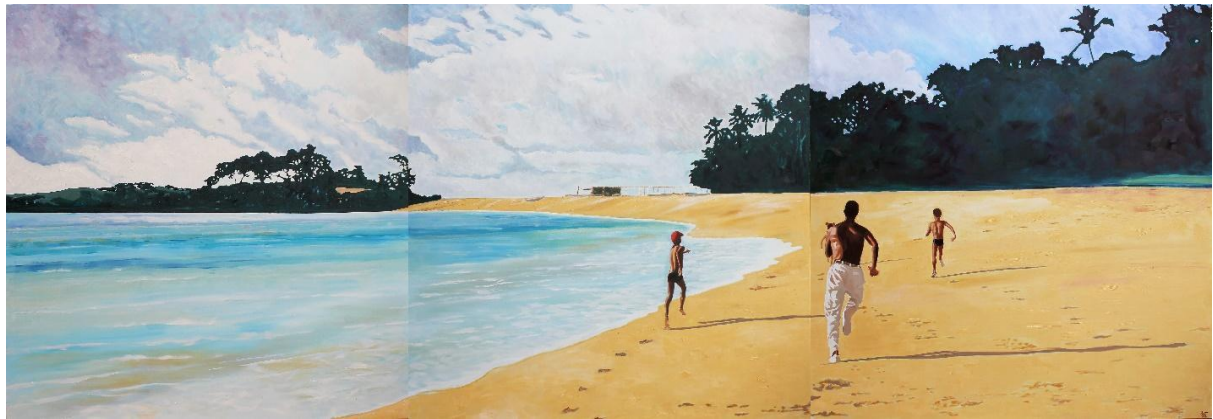
Arthur Timothy, triptych, ISABELLA'S HEAD START (LAKKA) (2022), Courtesy of the artist and Gallery 1957

Gallery 1957, London, is proud to announce an exhibition of new works from artist Arthur Timothy (b. 1957, Ghana) based on memories and photographs of Sierra Leone. Titled POSTCARDS FROM A PROMISED LAND , the exhibition surveys the people, architecture, and natural beauty of Sierra Leone, against a wider backdrop of the nation's history and hopes.